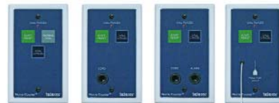
Tone Visual Stations