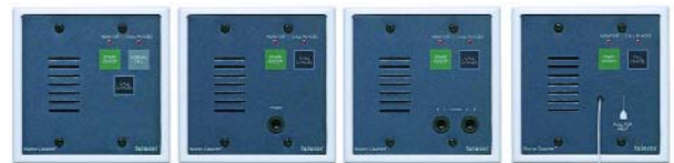
Room Intercom Stations

The NURSE COURIER®3 can incorporate a variety of stations to suit facility requirements: